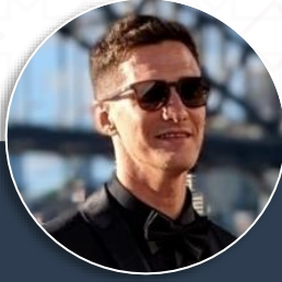
SAM Marketing & Maintenance